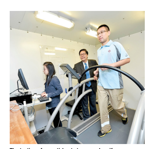
The testing of an anti-heat stress work uniform.

The garments have been adopted for use by these sectors in Hong Kong, Macau, Cambodia and Saudi Arabia, to promote occupational health.