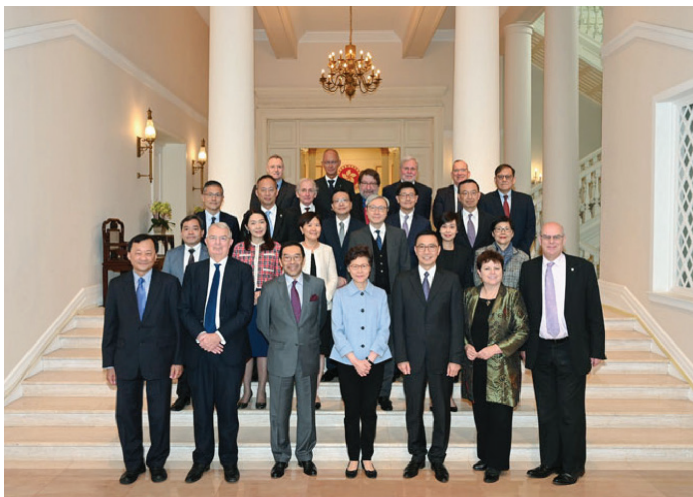
The Chief Executive, Mrs Carrie Lam (first row, centre); the Secretary for Education, Mr Kevin Yeung (first row, third right); the Chairman of the UGC, Mr Carlson Tong (first row, third left); and members of the UGC were pictured at Government House.

主席感謝行政長官在過去幾年為教資會資助界別提供了極大的支持。教資會將繼續不遺餘力，擔當政府與大學之間的橋樑角色，並就撥款及策略性發展等方面，為政府提供專業意見。