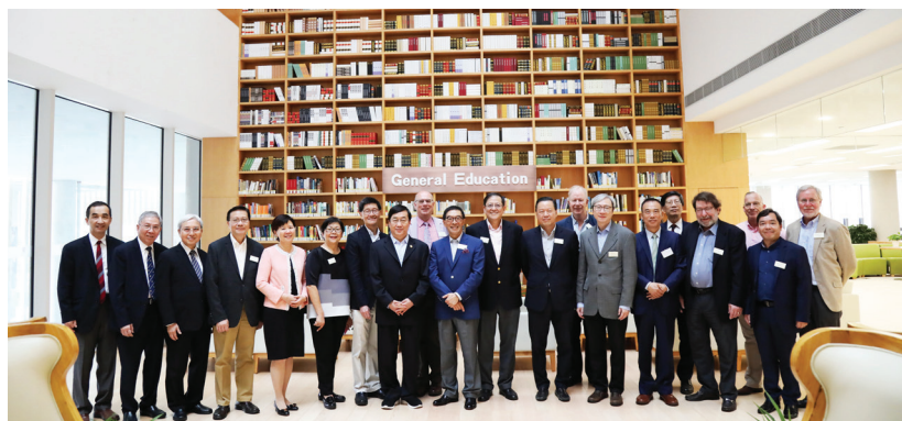
UGC Members visit the CUHK(SZ) and take group photos with the representatives of the CUHK(SZ).