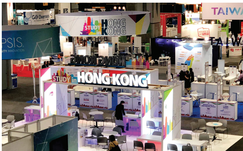
The Hong Kong pavilion at the NAFSA 2019 in Washington D.C..