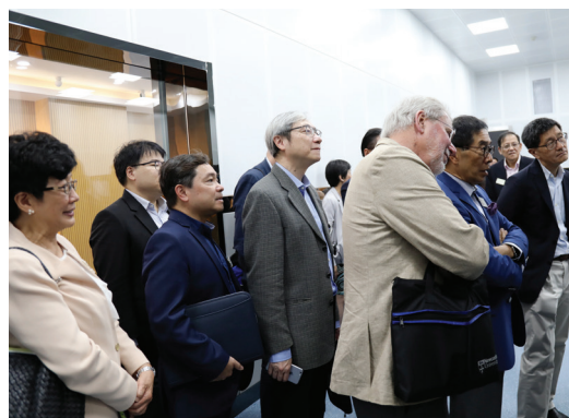
UGC Members visit the university library, Applied Spintronics Laboratory and the Kobilka Cryo-Electron Microscopy Center.

教資會成員參觀了中大(深圳)大學圖書館，應用自旋電子實驗室及科比爾卡冷凍電鏡中心。