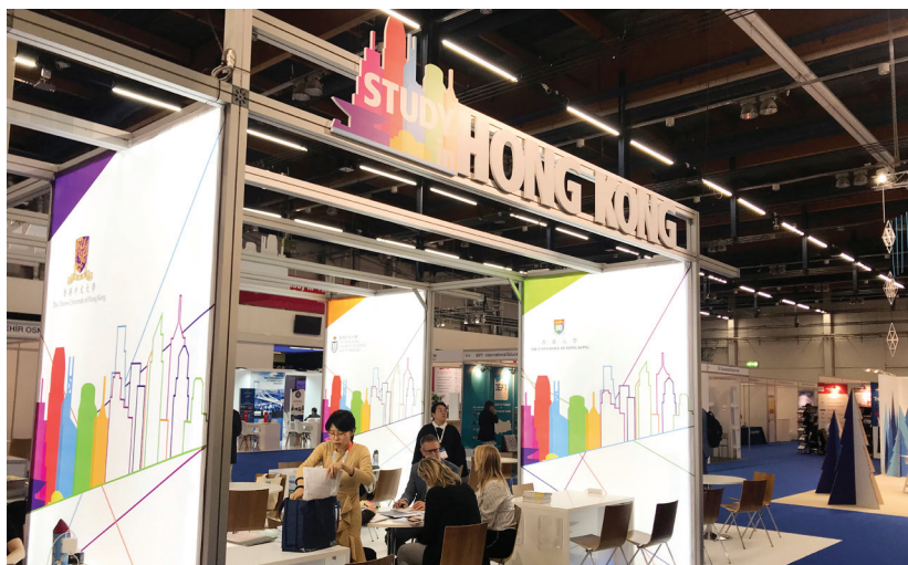
The Hong Kong pavilion at the EAIE 2019 in Helsinki.

為了共同推廣香港高等教育界，八所教資會資助大學參與2019年5月於華盛頓舉行的美洲教育者年會暨教育展，以及2019年9月於赫爾辛基舉行的歐洲國際教育者年會，並為整個界別設立香港館。