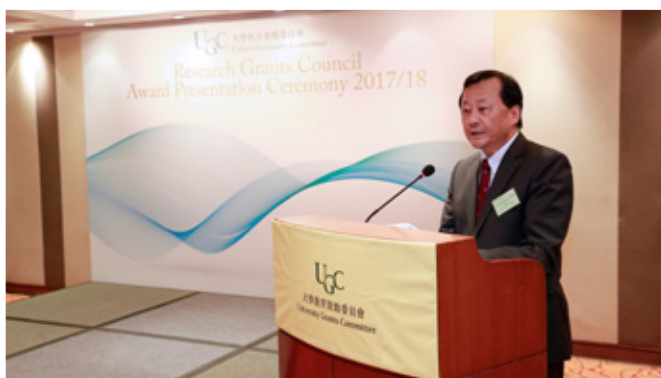
Chairman, RGC delivers a speech at the Ceremony. 研資局主席在典禮上致詞

傑出青年學者計劃與人文學及社會科學傑出學者計劃得獎者頒獎典禮於2017年10月19日舉行，以祝賀得獎者獲獎，並表揚他們的研究成就。