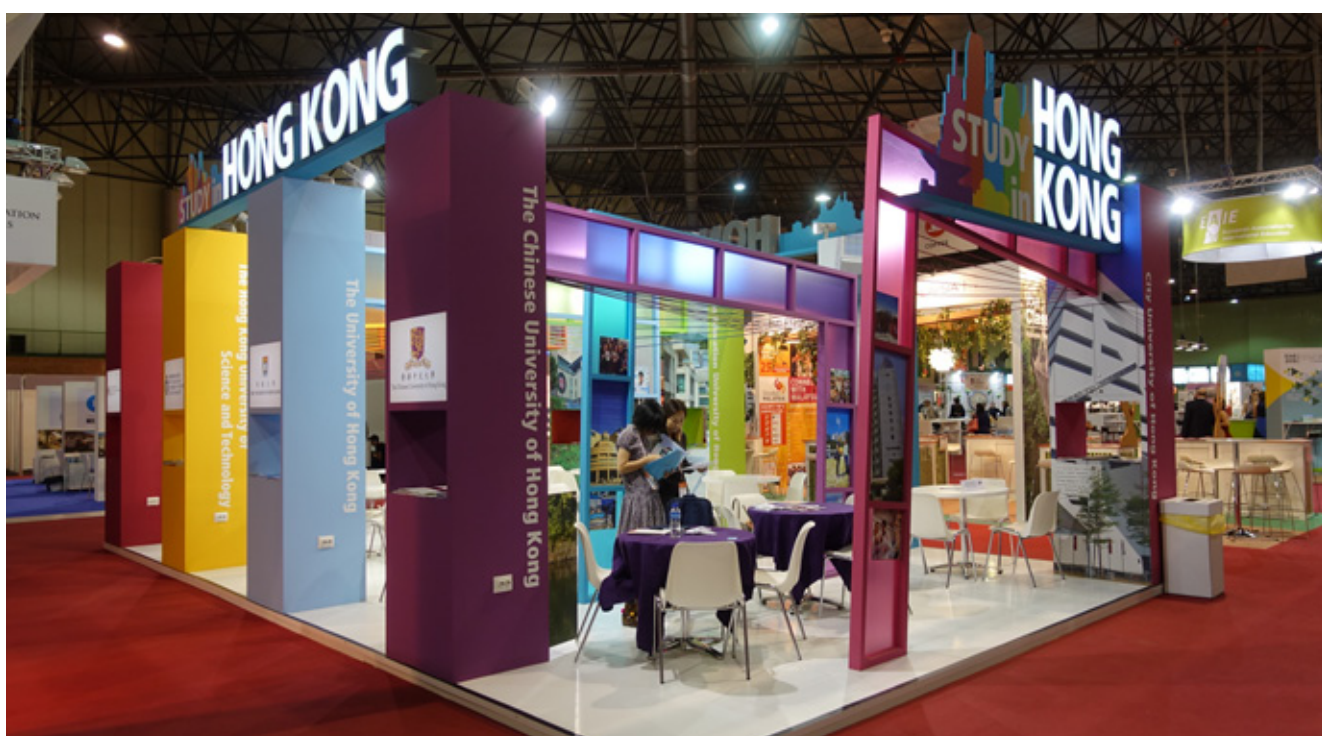
The Hong Kong Pavilion at the EAIE 2017 in Seville 於塞維利亞舉行的2017歐洲國際教育者年會中設立的香港館。

為了共同推廣香港高等教育界，八所教資會資助大學參與2017年5月底至6月初於洛杉磯舉行的美洲教育者年會暨教育展、2017年9月於塞維利亞舉行的歐洲國際教育者年會，以及2017年3月於新加坡舉行的2018亞太國際教育協會年會，並為整個界別設立香港館。