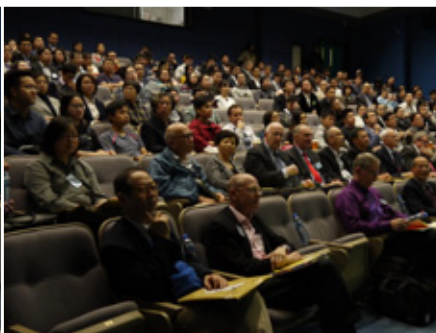
Project teams of 15 research projects present their progress at the CRF Symposium and have interesting discussions and exchange with researchers.