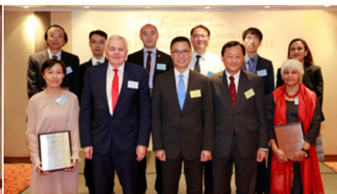
Awardees of the Early Career Award and the Humanities and Social Sciences Prestigious Fellowship 2017/18 with Chairman, RGC, Secretary for Education and former Secretary-General, UGC 2017/18傑出青年學者計劃及人文學及社會科學傑出學者計劃得獎者與研資局主席、教育局局長及教資會秘書長合照