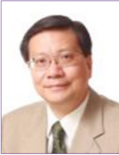
(Chairman of the Committee on Self-financing Post-secondary Education) (自資專上教育委員會主席)