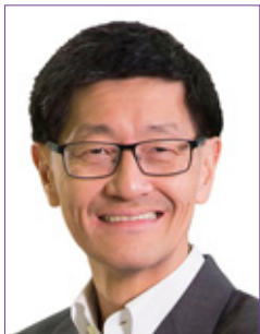
(Chairman of the Quality Assurance Council) (質素保證局主席)