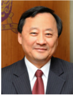
(Chairman of the Research Grants Council) (研究資助局主席)