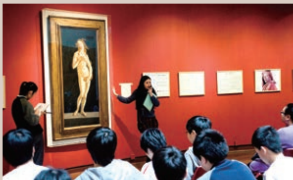
An institution organises art education programmes to promote art appreciation among the general public. 院校舉辦藝術教育活動，提升公眾藝術鑑賞能力。

教資會提供的資助，主要旨在鞏固院校的知識轉移能力。事實上，各院校已成立或擴充負責知識轉移的部門，從而改善跨院校整體的協調及加強推廣。院校認同應該讓大眾認識其知識轉移工作，而且意識到有必要採用可量度的方式去展示知識轉移的效益。此外，院校越發明白，在知識轉移方面，企業及企業精神是關鍵的一環。教資會希望在四年制新學制下，學生會有更多機會參與新創辦公司的工作，培養企業精神，並期望學士學位課程學生可與研究生、研究人員、校友、教學人員及其他員工建立聯繫網絡。