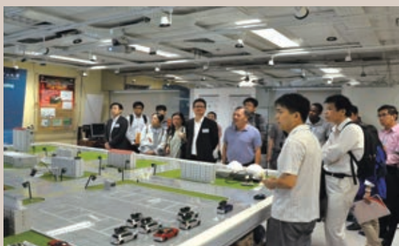
An institution shares its technological findings and experience in a laboratory tour for the industrial sector. 院校於實驗室參觀活動與業界分享其技術發現及經驗。