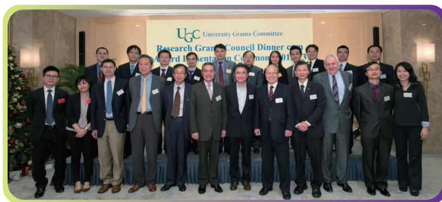
Awardees of the Early Career Award 2012/13 with Chairman, UGC; Former Chairman, RGC; Chairmen, RGC Subject Panels and Secretary-General, UGC. 2012/13學年傑出青年學者獎得獎人與教資會主席、前研資局主席、研資局學科小組主席及教資會秘書長合照