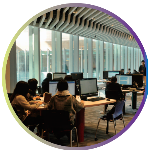
Learning Commons in Centennial Campus of HKU 港大百周年校園內的智華館