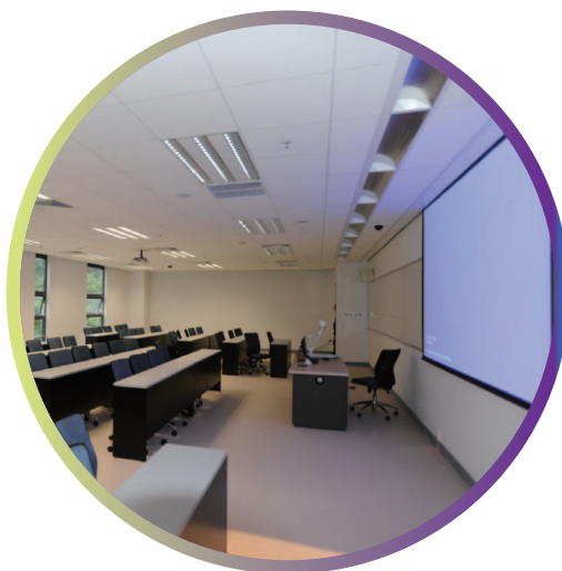
Classroom in Academic 3 of CityU 城大學術樓(三)內的課室