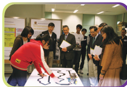
UGC Members visited CityU (left), PolyU (middle) and CUHK (right)