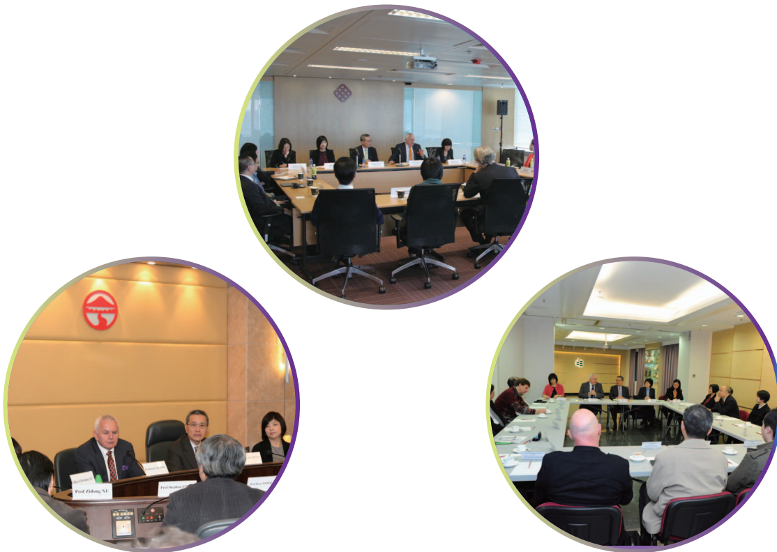
Chairman, UGC shared his views with the teaching staff of LU (left), PolyU (middle) and HKIEd (right) in March and April 2013.

教資會主席自2013年3月起到訪各資助院校，與學院院長及系主任會面，向他們介紹教資會的工作，並聽取他們對高等教育不同議題的意見和關注的事宜。這一輪院校巡迴訪問預計會在2014年初完成。