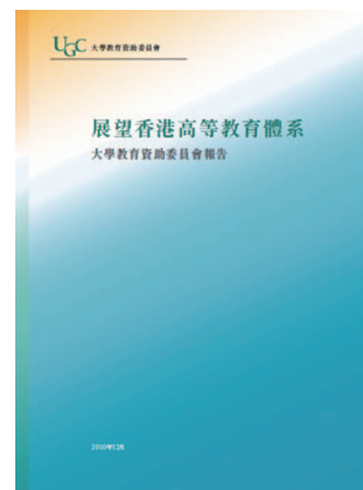
The UGC’s report “Aspirations for the Higher Education System in Hong Kong” (December 2010)