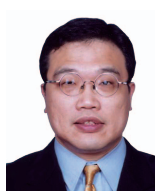
The Hon CHEUNG Chi-kong 張志剛議員

鄭教授為兒童骨科專家，並為多個香港及國際專業及醫學組織成員。他曾任香港中文大學副校長(2002-2012年)、香港手外科醫學會會長(1990-1992年)、香港骨科醫學會會長(1995-1996年)、香港醫務委員會執照組成員(1999-2001年)，以及香港特別行政區衛生署輔助醫療業管理局成員(1999-2002年)。