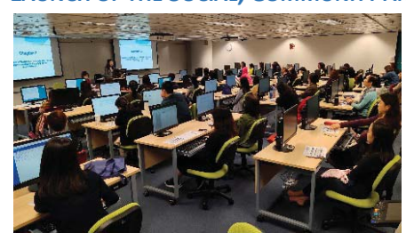
User training session for Social, Community and Cultural Engagement Activities Reporting System

To facilitate data collection and enhance the quality of data on the University's social, community and cultural engagement activities, the Technology Transfer Center (TTC) has taken the lead to develop the Social, Community and Cultural Engagement Activities Reporting System to help collect data on Key Performance Indicators (KPIs) for University-wide KT activities. The data collected serves as a measure of the University's performance in KT. Based on the concerted effort of various units, the system was refined and launched in May 2019 and used to collect data on KPIs in 2018-19. The System contributes great enhancement to the University KT data collection, reporting and analysis endeavours.