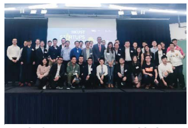
HKUST Start-up x Investors 2018

HKUST Start-up x Investors 2018 (SxI): TTC and EC jointly hosted SxI 2018, the TTC's flagship event, on 4 December 2018 to connect HKUST technopreneurs and start-ups with the investment community and professional networks. 37 HKUST technology start-ups from five technology areas participated in this event, showcasing their innovative technologies, breakthrough business ideas, remarkable products and unique services. To present their business models, services and products, start-up teams gave two-minute presentations at a pitching session and exchanged ideas with other start-up teams and investors at a mingling session to gain inspiration for further developing their