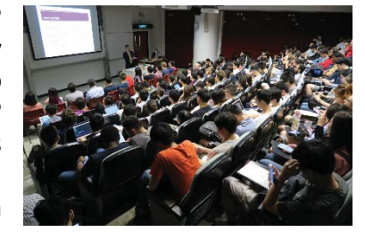
The IP seminars attracted more than 300 attendees

IP Seminars: HKUST organised three seminars in partnership with prominent IP practitioners and renowned IP firms to equip researchers in the University community with essential IP knowledge and skills. The elementary IP seminars "An Introduction to Intellectual Property and its Protection Strategies" and "Is My Invention Patentable? Patent 101 – Fundamental Concepts in Patent Law" explored fundamental concepts relating to different IP types, patent laws and patent filing and prosecution strategies. Beyond this basic introduction to IP, an advanced IP seminar entitled "Is Your Invention Inventive? – What Is Obvious Is Not Obvious: A Conversation with Your Patent Attorney" was held to illustrate the basic legal framework of the concept of obviousness in patent