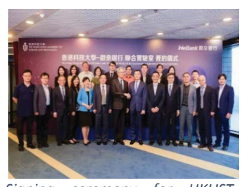
Signing ceremony for HKUST-WeBank Joint Laboratory

HKUST joined hands with WeBank Co. Ltd (WeBank) to establish the HKUST-WeBank Joint Laboratory in May 2019, an exciting new platform for exploring cutting-edge banking technologies and nurturing talents. Leveraging both parties' expertise in research and KT in the GBA, researchers at the laboratory will collaborate in areas ranging from AI, big data and blockchain to financial and regulatory technologies. At a higher level, this collaboration will also provide a platform for enterprises, universities and research institutes to promote KT under the GBA Development Framework.