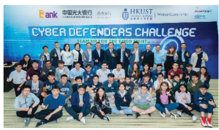
Cyber Security Defenders Competition

Collaborated with the School of Business and Management (SBM) and China Everbright Bank Hong Kong (CEBHK), EC organised the Bank's first academic-industry collaborated cyber security competition for students. The aim was to promote cyber security awareness and give students the opportunity to address some real-world threats faced by information security experts. The full-day event was held at HKUST in May 2019. IT experts from CEBHK were invited to provide training and share their real-life experiences of protecting their customers from hackers and complying with best practice.