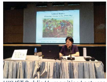
HKUST Public Humanities Lectures

Since April 2012, HKUST's Division of Humanities has partnered with the Hong Kong Museum of History to hold a series of public lectures on topics in the humanities, namely the HKUST Public Humanities Lectures ("科大人文新語"講座系列). Delivered by HKUST faculty, the lectures are designed to strengthen community engagement and share with the public advanced multidisciplinary knowledge in the humanities. 16 lectures in this series were held in 2018-19, covering topics from art and history to linguistics and ideology.