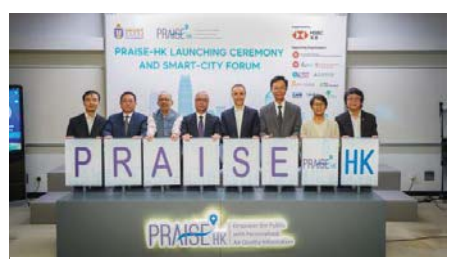
IENV officially launched its "Personalised Real-time Air-quality Informatics System for Exposure – Hong Kong" (PRAISE-HK) App.

In June 2019, HKUST's Institute for the Environment (IENV) launched the "Personalised Real-time Air-quality Informatics System for Exposure – Hong Kong" (PRAISE-HK), a new smartphone app designed to reduce users' exposure to air pollution and ultimately help develop Hong Kong into a world-class smart and healthy city.