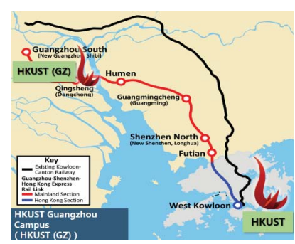
HKUST Guangzhou Campus

HKUST has been putting much effort in exploring opportunities in the Greater Bay Area (GBA) in extending the University's influence in KT from Hong Kong to nearby cities, and actively participating in the development of the GBA. The establishment of HKUST Guangzhou (HKUST (GZ)) Campus, with application submitted to the Ministry of Education (MOE) in April 2019, would be the best manifestation of the close cooperation with Mainland counterparts and the dedication to make influential societal impact beyond Hong Kong. Postgraduate students will be admitted in the initial phase, with admission size eventually growing up to 4,000. The first phase of the HKUST (GZ) Campus construction is anticipated to complete in 2022. With the new campus located next to the newly planned high-tech park in Guangzhou, HKUST students could better transfer their research achievements and innovative ideas