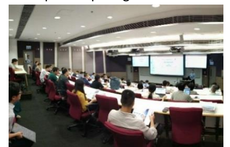
The Information Session at HKUST

The Supercomputing Service Platform enables HKUST faculty members and researchers to access to National