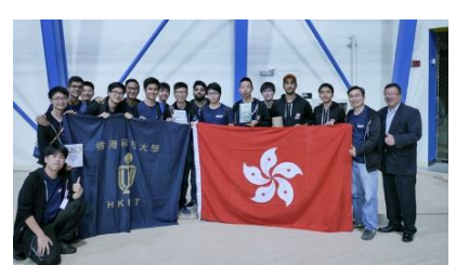
Group photo of HKUST Remotely Operated Vehicle (ROV) Team, champion of MATE International ROV Competition 2017

The Student Innovation for Global Health Technology (SIGHT) enables undergraduates to work on their self-proposed healthcare projects in full time internship locally or overseas. To highlight, one team initiated a diabetic retinopathy screening program for Indonesia and the other team planned to further deploy a mobile app building on the foundation of the laptop-based electronic medical record system which set up by an earlier SIGHT team in 2015 for medical staffs in Cambodia. HKUST received a donation from Equal Opportunities Foundation for the establishment of Scholar Scheme for SIGHT program.