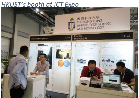
HKUST's booth at Startup Launchpad