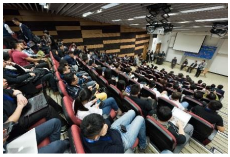
Over 200 visitors joined Sxl plenary session