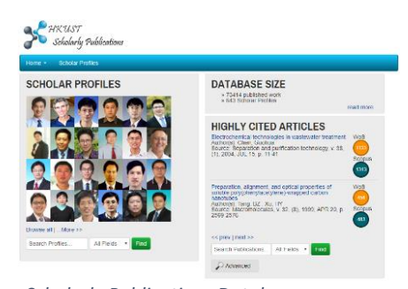
Scholarly Publications Database

The Scholarly Publications Database (SPD) provides an interface for the public to learn of the expertise at HKUST by showcasing the research output of the University as well as the local, regional and international research collaboration. 1.78 million page views are recorded in 2016-17, constituting a 30% increase from previous year. Together with SPD, the DataSpace@HKUST launched last year, provides a platform for HKUST researchers to publish and manage their research data.