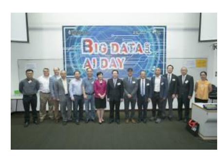
World-class academic and industry leaders in Big Data and AI fields, and HKUST faculty members

The Big Data Institute organized its first Big Data and AI Day, playing host to a stellar assemblage of world top academics and industry celebrities in the realm of Big Data and Artificial Intelligence (AI). The event drew a learned audience of over 500 guests, including local and overseas academics, leaders in the Big Data and Al-related industries, as well as students from various tertiary institutions in Hong Kong and abroad. The overwhelming attendance attested to the key role of HKUST's research in these fields.