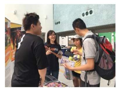
Students looking for opportunities during the E-Week

B.E.S.T. Camp: As an effort to promote entrepreneurship within science students and mingle students from different departments, B.E.S.T. (Business, Engineering, and Science Together) Orientation Camp was held to explore environmental, bio and nano business opportunities. Out of 31 student participants, 9 were from the School of Science (SSCI) (29%) and 18 from the School of Engineering (SENG) (58%).