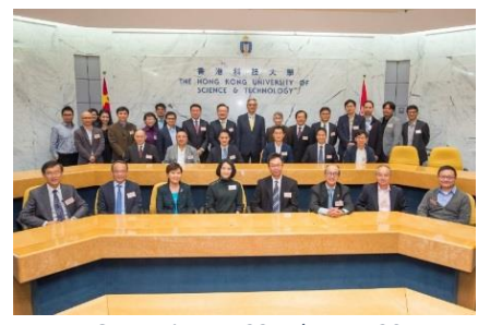
1st KTAG Meeting on 23 February 2017

The Knowledge Transfer Advisory Group (KTAG) was formed in 2016 to offer advice to university management to advance its KT activities in Hong Kong, the Mainland, and worldwide. The first KTAG meeting was held in February 2017. Advisors learnt the recent status of HKUST's KT and provided valuable suggestions to its development. It is expected that KTAG will facilitate and support HKUST's engagement with industrial sectors, business enterprises and NGOs to elevate the University's KT impact in order to equip students and faculty members for the fast moving KT landscape.