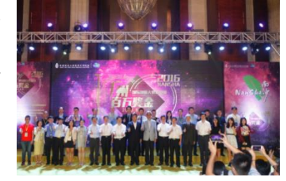
Grand Final of 2016 HKUST One Million Dollar Entrepreneurship in Nansha, Guangzhou on 6 August 2016

innovators across the border. In 2016, HKUST One Million Dollar Entrepreneurship Competition expanded its reach from Clear Water Bay Campus to Macau, Beijing, Shenzhen and Guangzhou. A total of 500