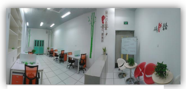
The newly established Entrepreneur Center

biological medicine, integrated circuit, etc.