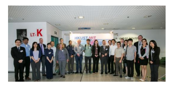
The Semi-Annual Review of Projects in June 2015 at HKUST

The HKUST-MIT Alliance aims to build the network and mechanism required for R&D collaboration between world class universities and technology companies and conduct industry-driven pre-competitive research. By the end of 2014/15, this Consortium has received a total of 9 new proposals from local universities, in which three were highly recommended and submitted to the Innovation & Technology Commission for funding application under the Data Science & E-Learning cluster.