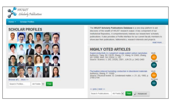
Home page of the HKUST Scholarly Publications Database (SPD)

To enhance knowledge harvesting and dissemination, HKUST has developed a publication analysis system which contains over 61,000 scholarly publications from our researchers, covering journal articles, conference papers, book chapters, books, and patents, and about 550 scholar profiles. The general public can access the system and look up HKUST's researchers, their publications and areas of expertise. The system attracted over 660,000 page views in 2014, thus greatly enhancing the visibility of our researchers and potentially generating a larger impact.