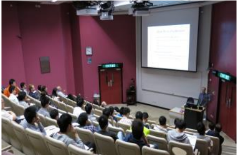
IP Seminar: Best Timing for IP Protection— Publication vs Patent Application