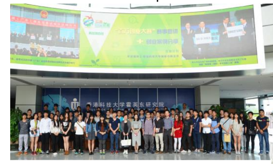
"Redbird Entrepreneur Cradle" (紅鳥創業苗圃) held in Nansha in Jan 2015.

During the reporting year, FYTRI has organized five entrepreneurial training workshops under the "Redbird Entrepreneur