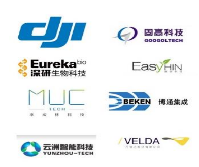
Start-up enterprises stationed in IER Buildina

The HKUST Shenzhen Research Institute (SRI) continues to play a vital role in the University's innovation and technology advancement in the Mainland. SRI has been approved as the supporting organization of NSFC since 2011 and has developed extensive collaborations with research institutions and enterprises in the Mainland. The six centers and labs specialized in the fields of molecular neuroscience, novel emissive material, traditional Chinese medicine, automation & UAV, marine environment and livelihood have shown distinguished research capacity and outputs. Another five collaborative labs are hosted jointly by SRI and industrial partners with the aim of accelerating technology transfer and enhancing applied research collaboration.