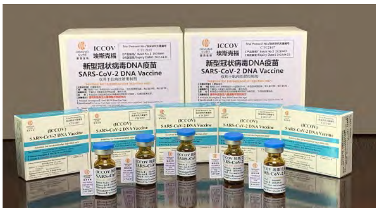
The DNA-based COVID19 vaccine developed in partnership with Immuno Cure Biotech Limited