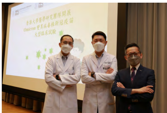
HKU and CNBG started the clinical trial on the Omicron-targeting vaccine