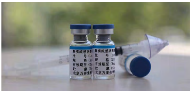
The nasal spray vaccine manufactured by Wantai BioPharm