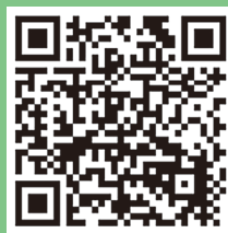
Teaching Award Highlights Videos

由2022年傑出教學獎開始，教資會將會更加重視跨學科及跨院校協作在推廣教與學體驗的重要性。獎項將繼續設有三個組別，在繼續肯定個人成就的同時，隊伍組別將會改稱為「協作團隊」組別，提名資格準則亦會相應修改，以反映教資會期望鼓勵協作。此外，如往年頒獎典禮上所宣布，教資會將調高獎金百分之五十，由五十萬元增至七十五萬元，以展現教資會對得獎者的貢獻、創意及專業成就的肯定，並為他們就提升香港高等教育的教與學質素的計劃提供更好的支援。教資會已經開展2022年傑出教學獎的準備工作，並正邀請教資會資助大學在2022年4月底前遞交提名。