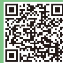
教資會傑出教學獎短片