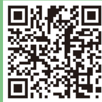
Legislative Council Brief

教資會正與大學攜手合作，推動政府就2022-25三年期規劃工作的四項策略方針，當中包括(i)大學應以大膽創新的策略性思維制定更長遠規劃周期；(ii)在院校層面以不同形式整合個別課程；(iii)全人發展；及(iv)進一步加強基礎研究能力及鼓勵應用研究。展望未來，教資會會深入探討不同的策略議題，以準備下一個三年期的規劃工作，包括各教資會資助大學在粵港澳大灣區設立校園的計劃。教資會會與政府及教資會資助界別就這些重要議題保持繼續緊密溝通。