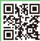
HK Research Portal 「香港研究一站通」

在上述資助機構的合作下，網站於2022年1月下旬正式啟用。歡迎市民及本地研究員瀏覽以獲取有關香港研究領域的最新資訊。