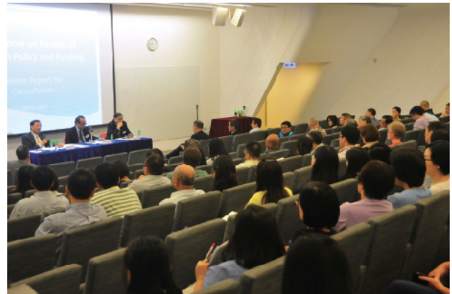
Exchange of views between participants and the Task Force