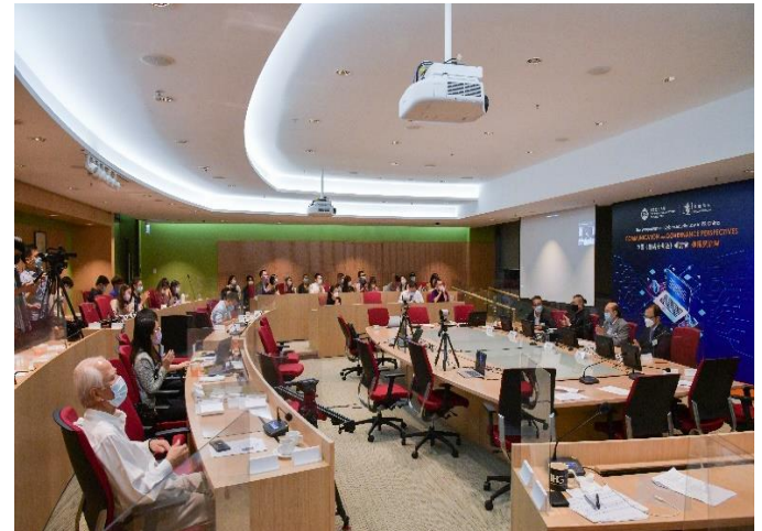
The face-to-face Session: Participants listening intently to the speakers