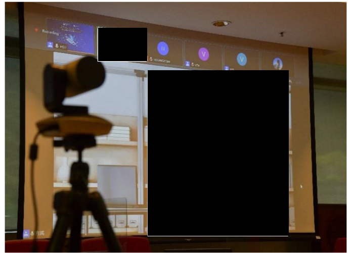
The VooV(Tencent) Meeting as the online platform