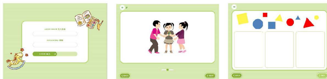
Photo of iPad Version

Exceeded objectives. An iPad Version of the Early Childhood Development Assessment Scale was developed