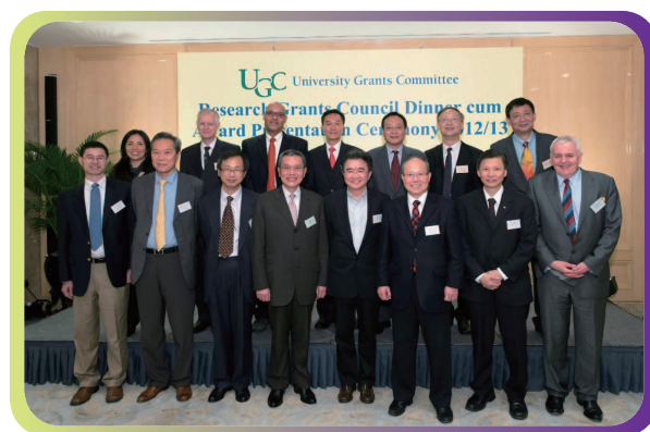
Awardees of the Humanities and Social Sciences Prestigious Fellowship Scheme 2012/13 with Chairman, UGC; Former Chairman, RGC; Chairmen, RGC Subject Panels; and Secretary-General, UGC. 2012/13 学年人文学及社会科学杰出学者计划得奖人与教资会主席、前研资局主席、研资局学科小组主席及教资会秘书长合照