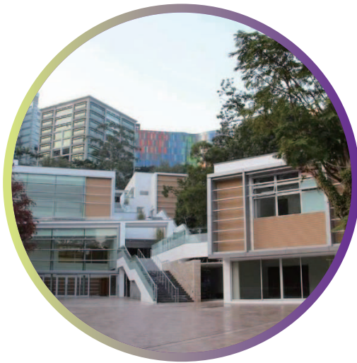
CUHK's Student Amenity Centre 中大的学生活动中心