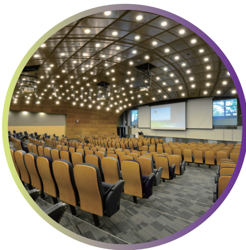
Lecture Theatre in Phase 8 Development of PolyU 理大第八期校园发展计划的演讲厅