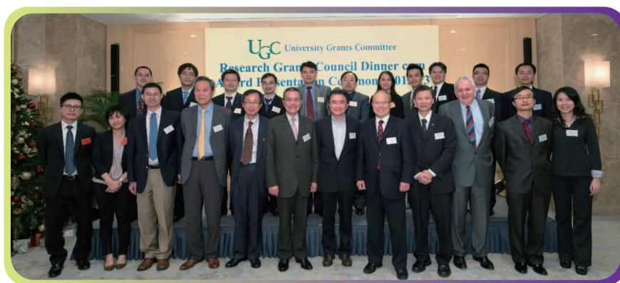
Awardees of the Early Career Award 2012/13 with Chairman, UGC; Former Chairman, RGC; Chairmen, RGC Subject Panels and Secretary-General, UGC. 2012/13 学年杰出青年学者奖得奖人与教资会主席、前研资局主席、研资局学科小组主席及教资会秘书长合照