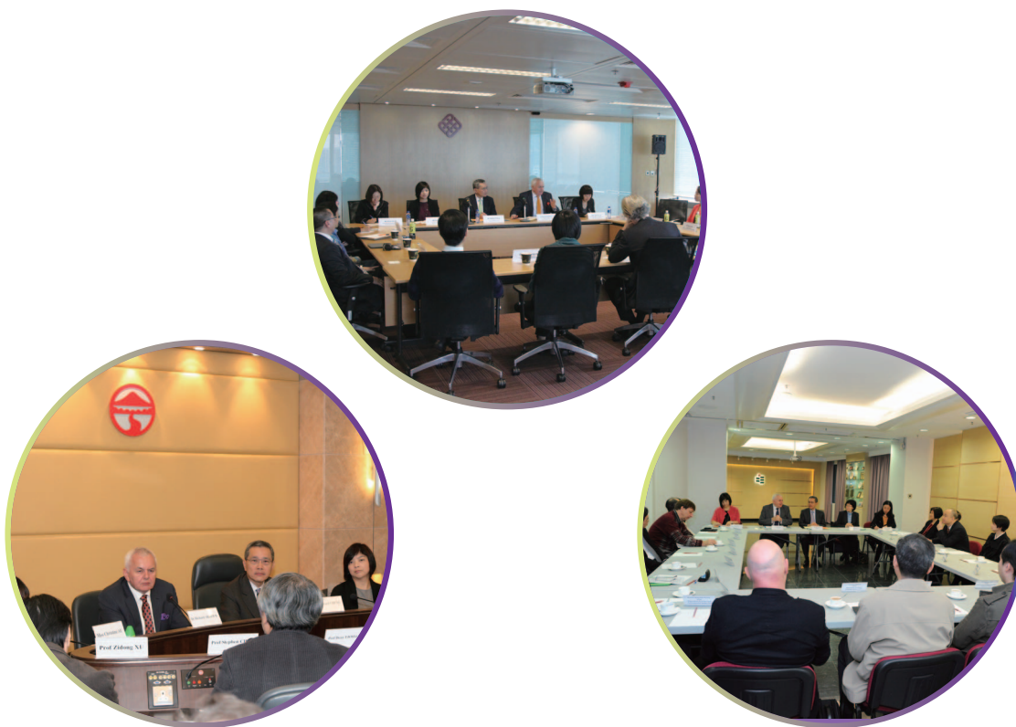
Chairman, UGC shared his views with the teaching staff of LU (left), PolyU (middle) and HKIEd (right) in March and April 2013.

教资会主席自2013年3月起到访各资助院校，与学院院长及系主任会面，向他们介绍教资会的工作，并听取他们对高等教育不同议题的意见和关注的事宜。这一轮院校巡回访问预计会在2014年初完成。