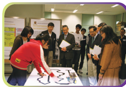
UGC Members visited CityU (left), PolyU (middle) and CUHK (right)