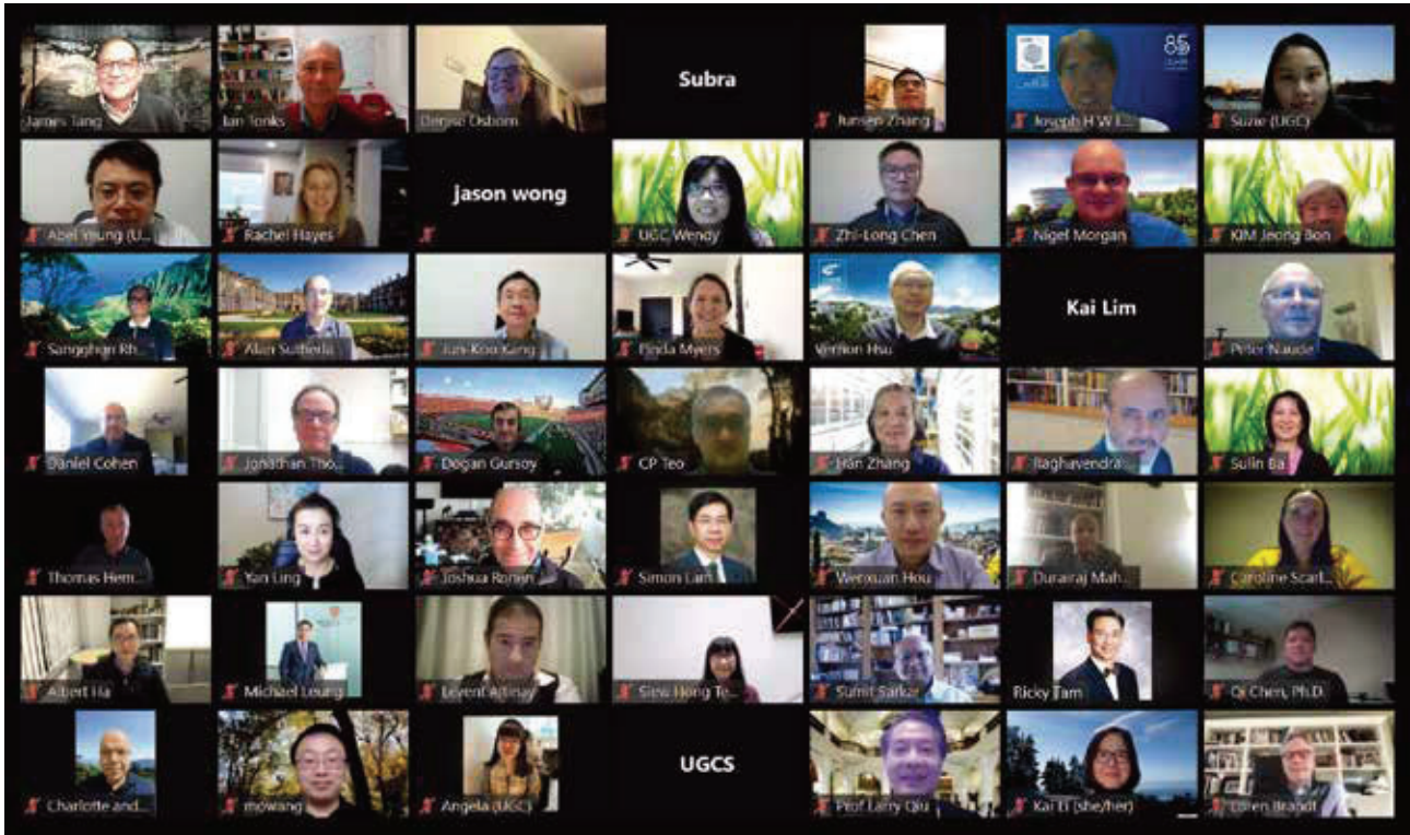
Business & Economics Panel 商科及經濟評審小組