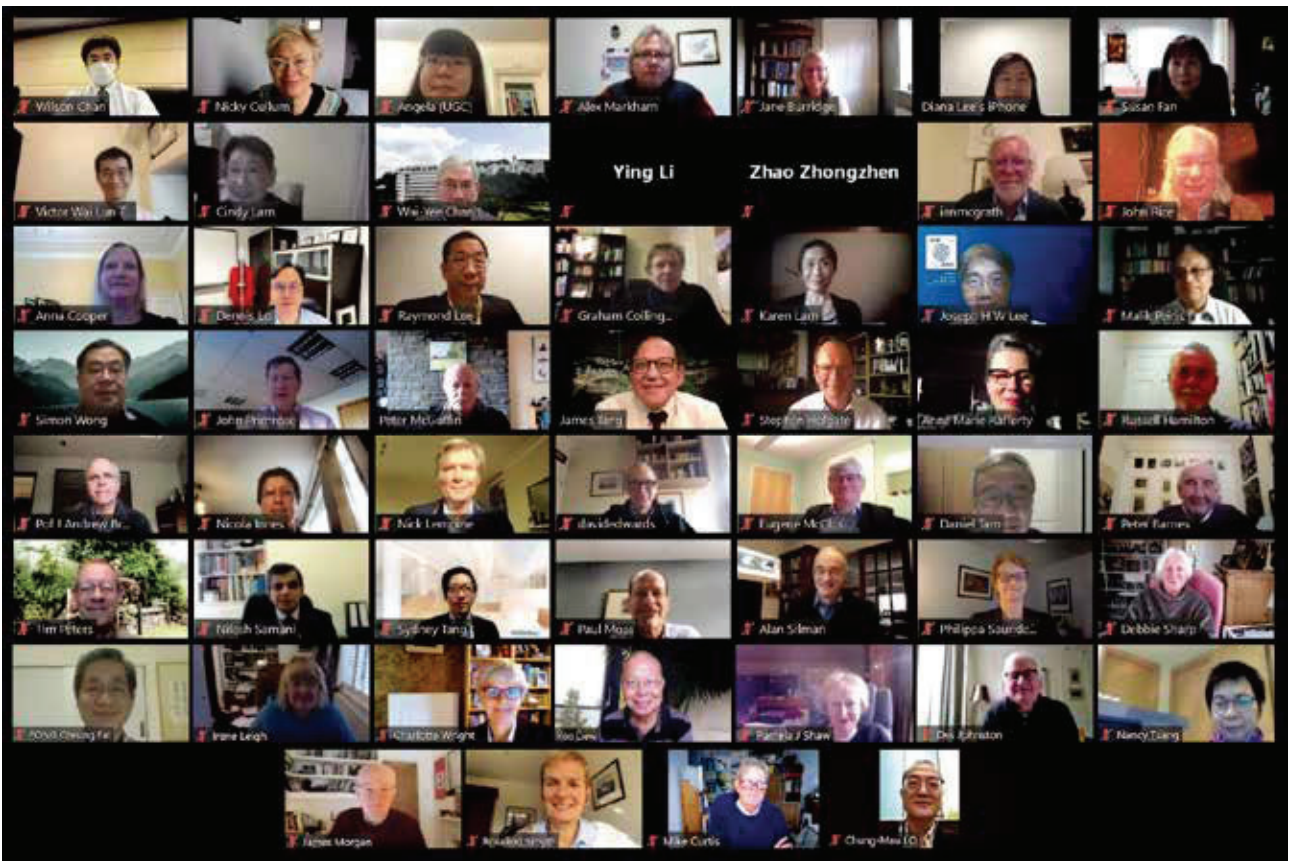
Health Sciences Panel 醫學及衛生科學評審小組