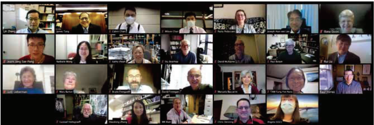
Biology Panel 生物學評審小組

在新冠病毒疫情挑戰下，13個評審小組於2020年8月至2021年1月期間，不辭勞苦地進行網上視像會議，完成艱巨的評審工作。