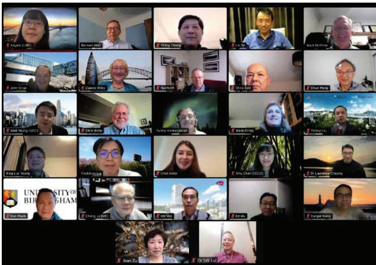
Engineering Panel 工程學評審小組