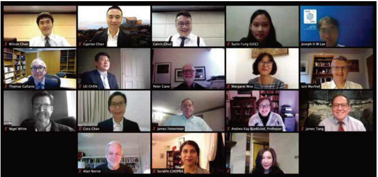
Law Panel 法律評審小組