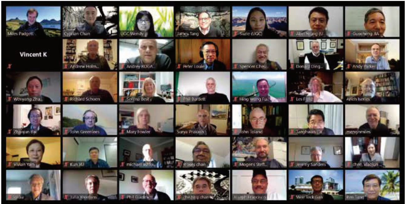
Physical Sciences Panel 自然科學評審小組