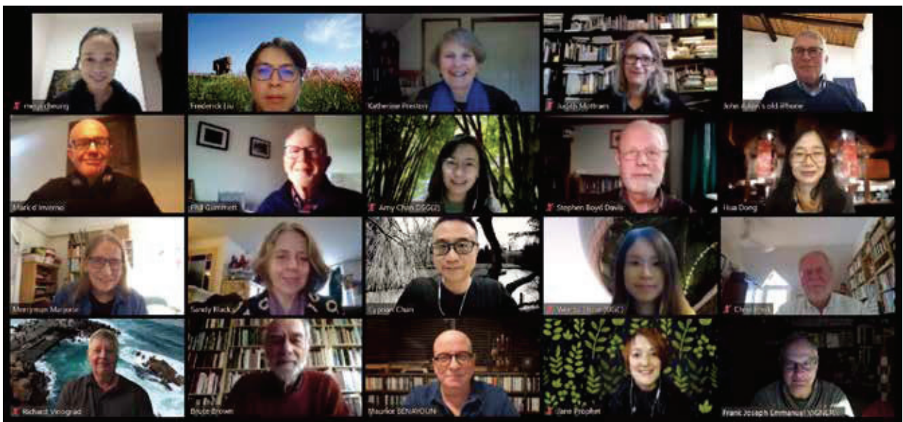
Creative Arts, Performing Arts & Design Panel 創意藝術、表演藝術及設計評審小組