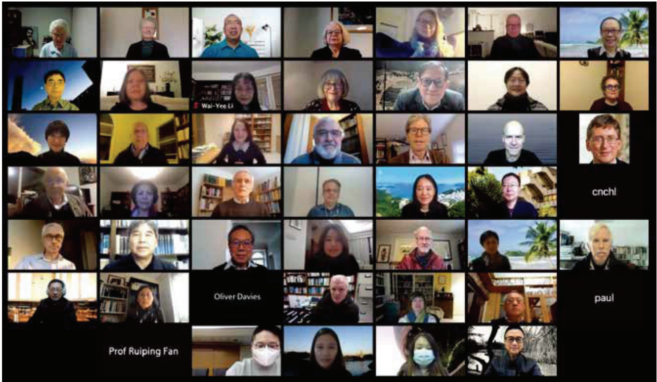
Humanities Panel 人文學評審小組