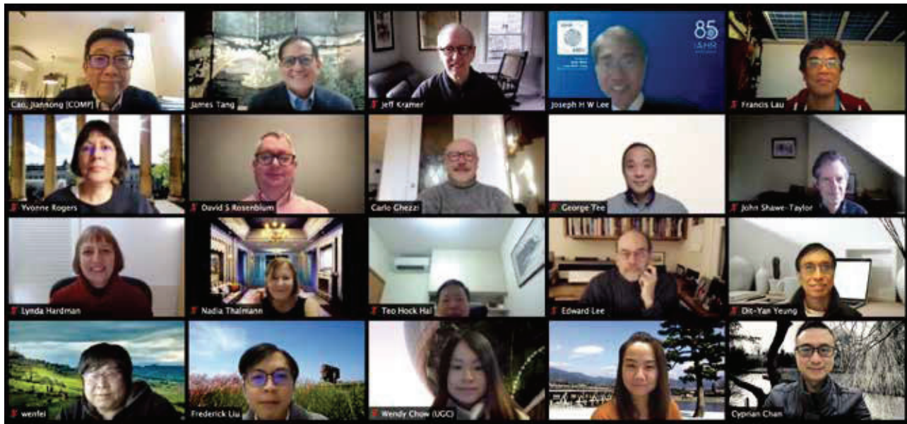
Computer Science/Information Technology Panel 電腦科學 / 資訊科技評審小組