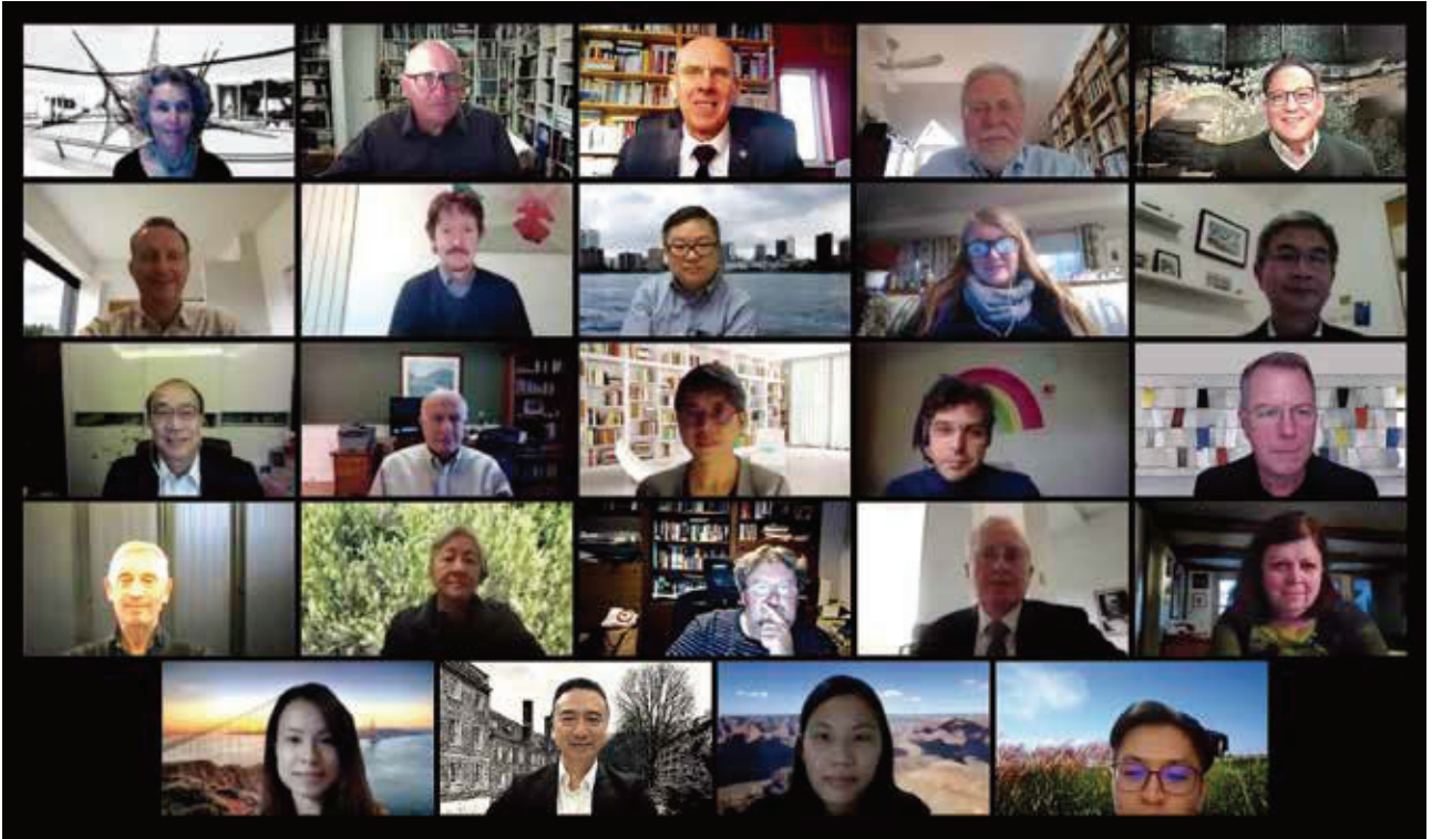
Built Environment Panel 建造環境評審小組