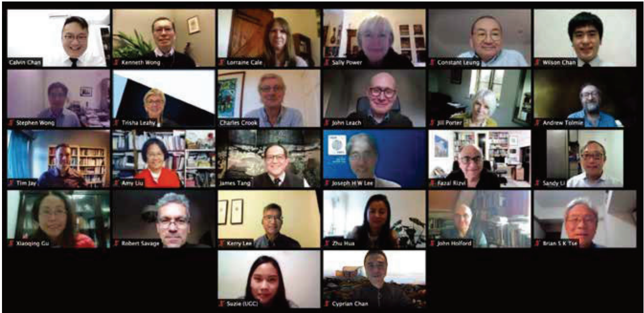
Education Panel 教育評審小組