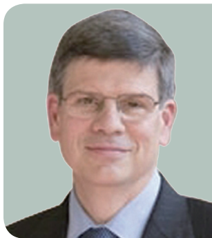
PROFESSOR WILLIAM KIRBY

甘博士現為醫院管理局成員(2013-)及香港工業總會成員(2013-)。他是財務匯報局前行政總裁(2010-2013)，並曾擔任香港會計師公會會長(1999-2000)、嶺南大學校董(1999-2004)。他亦曾任廉政公署防止貪污諮詢委員會(1999-2004)、牌照上訴委員會(2000-2005)、旅遊業賠償基金管理委員會(2001-2007)、香港證券及期貨事務監察委員會程序覆檢委員會(2004-2010)及廉政公署審查貪污舉報諮詢委員會(2007-2010)的成員。