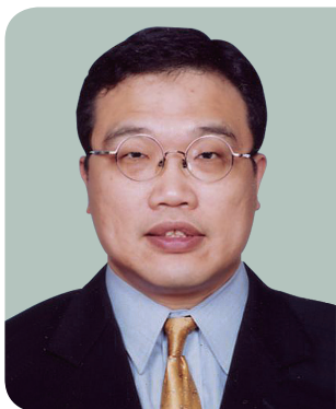
THE HON CHEUNG CHI-KONG, BBS, JP