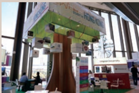
The Hong Kong pavilion at the EAIE 2014 in Prague, the Czech Republic in September 2014. 2014年9月在捷克布拉格舉行的2014歐洲教育者年會中設立的香港館。

為了共同推廣香港高等教育界，八所資助院校參與於2014年9月於布拉格舉行的2014歐洲國際教育者年會、2015年3月在北京舉行的2015亞太國際教育協會年會以及2015年5月在波士頓舉行的美洲教育者年會，並為整個界別設立香港館。教資會秘書長率領參與亞太國際教育協會年會及美洲教育者年會的代表團，並於美洲教育者年會期間主持早餐會，有超過300位嘉賓參與。教資會院校正好藉此良機與新夥伴探索協作機會，並與現有夥伴保持聯繫。