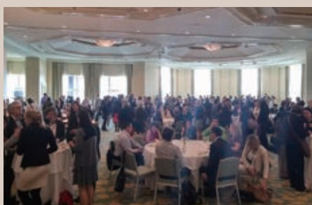
A breakfast reception hosted by the Secretary-General of UGC during the NAFSA 2015. 教資會秘書長在2015美洲教育者年會期間主持早餐會。