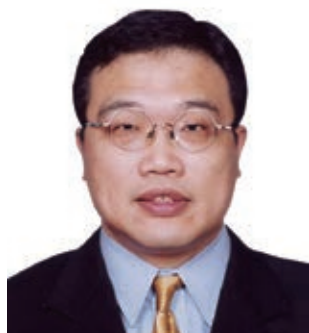
THE HON CHEUNG CHI-KONG, BBS, JP