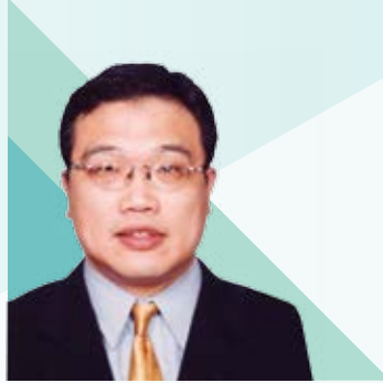
The Hon CHEUNG Chi-kong, BBS, JP

鄭教授為兒童骨科專家，並為多個香港及國際專業及醫學組織成員。他曾任香港中文大學副校長(2002-2012年)、香港手外科醫學會會長(1990-1992年)、香港骨科醫學會會長(1995-1996年)、香港醫務委員會執照組成員(1999-2001年)，以及香港特別行政區衛生署輔助醫療業管理局成員(1999-2002年)。