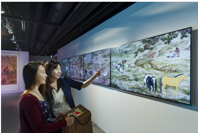
Visitors are invited to re-colour horses from Castiglione’s painting in this exhibit designed by the School of Creative Media.

“Giuseppe Castiglione – Lang Shining New Media Art Exhibition” runs from April to late August 2016. It highlights the Italian Jesuit 郎世寧 Giuseppe Castiglione’s (1688-1766) artworks and their historical context through pioneering a modern presentation of historical paintings. Castiglione, an eminent court painter, architect and art designer, spent 51 years in the Qing Empire’s palace and produced many excellent works during the reigns of Emperors Kangxi (康熙), Yongzheng (雍正) and Qianlong (乾隆). Blending European techniques with China’s traditional artistic methods, his works have opened up a new perspective on Chinese painting and won admiration in China. The exhibition’s innovative design combines historical artworks, new media and contemporary interactive art to create for the visitors an impressive multi-sensory experience. Full-size facsimiles of Castiglione’s paintings, characteristic of the East-meet-west style, are presented side by side with creative, digital interpretations of these works. Visitors are invited to shuffle in time to compare the traditional and contemporary models of representation.