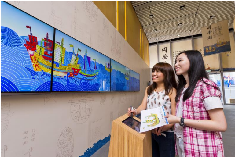
Visitors were making personalized Tong-an Ships for themselves with the painting programme in the tablet.

“Giuseppe Castiglione – Lang Shining New Media Art Exhibition” runs from April to late August 2016. It highlights the Italian Jesuit 郎世寧 Giuseppe Castiglione’s (1688-1766) artworks and their historical context through pioneering a modern presentation of historical paintings. Castiglione, an eminent court painter, architect and art designer, spent 51 years in the Qing Empire’s palace and produced many excellent works during the reigns of Emperors Kangxi (康熙), Yongzheng (雍正) and Qianlong (乾隆). Blending European techniques with China’s traditional artistic methods, his works have opened up a new perspective on Chinese painting and won admiration in China. The exhibition’s innovative design combines historical artworks, new media and contemporary interactive art to create for the visitors an impressive multi-sensory experience. Full-size facsimiles of Castiglione’s paintings, characteristic of the East-meet-west style, are presented side by side with creative, digital interpretations of these works. Visitors are invited to shuffle in time to compare the traditional and contemporary models of representation.